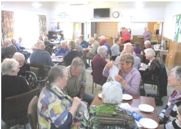
Lunch with the Morrinsville Selwyn Group at Te Aroha on October 6th.