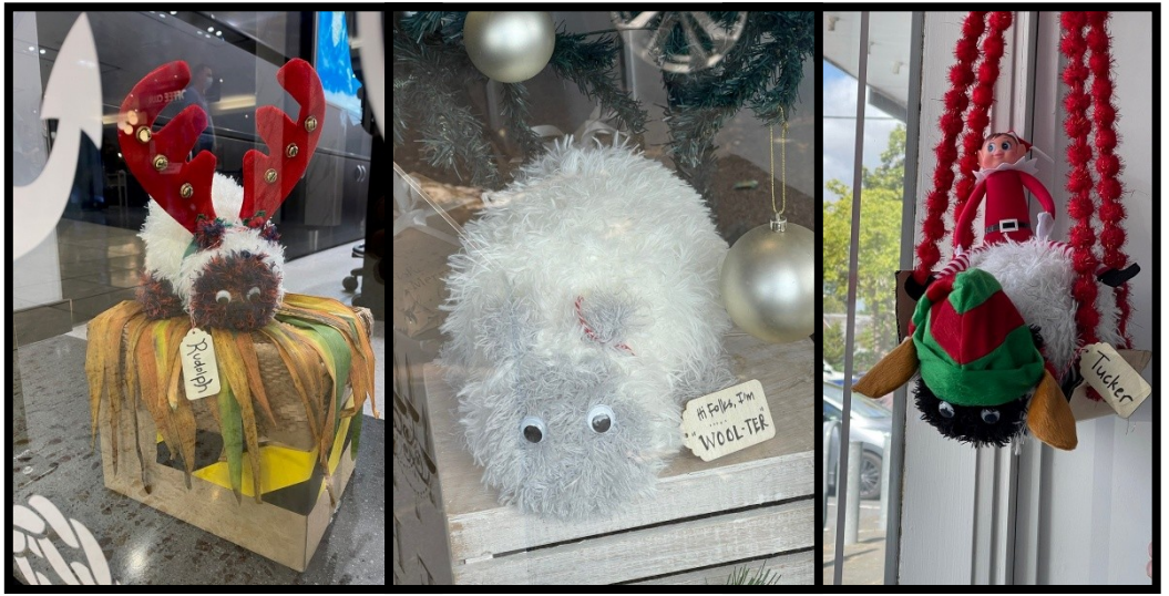
Just some of the very creative ways the sheep were named and displayed